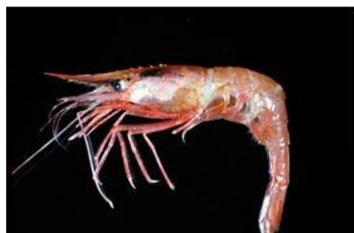
Striped shrimp ( Pandalus montagui )