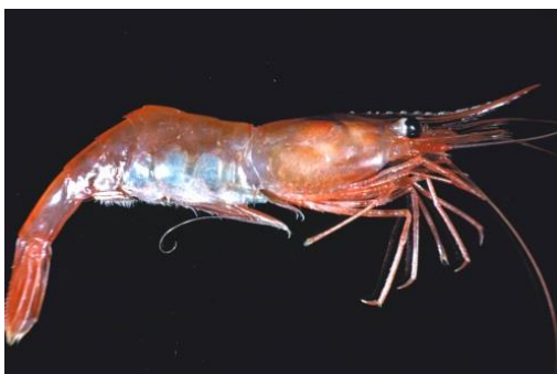
Northern shrimp ( Pandalus borealis )