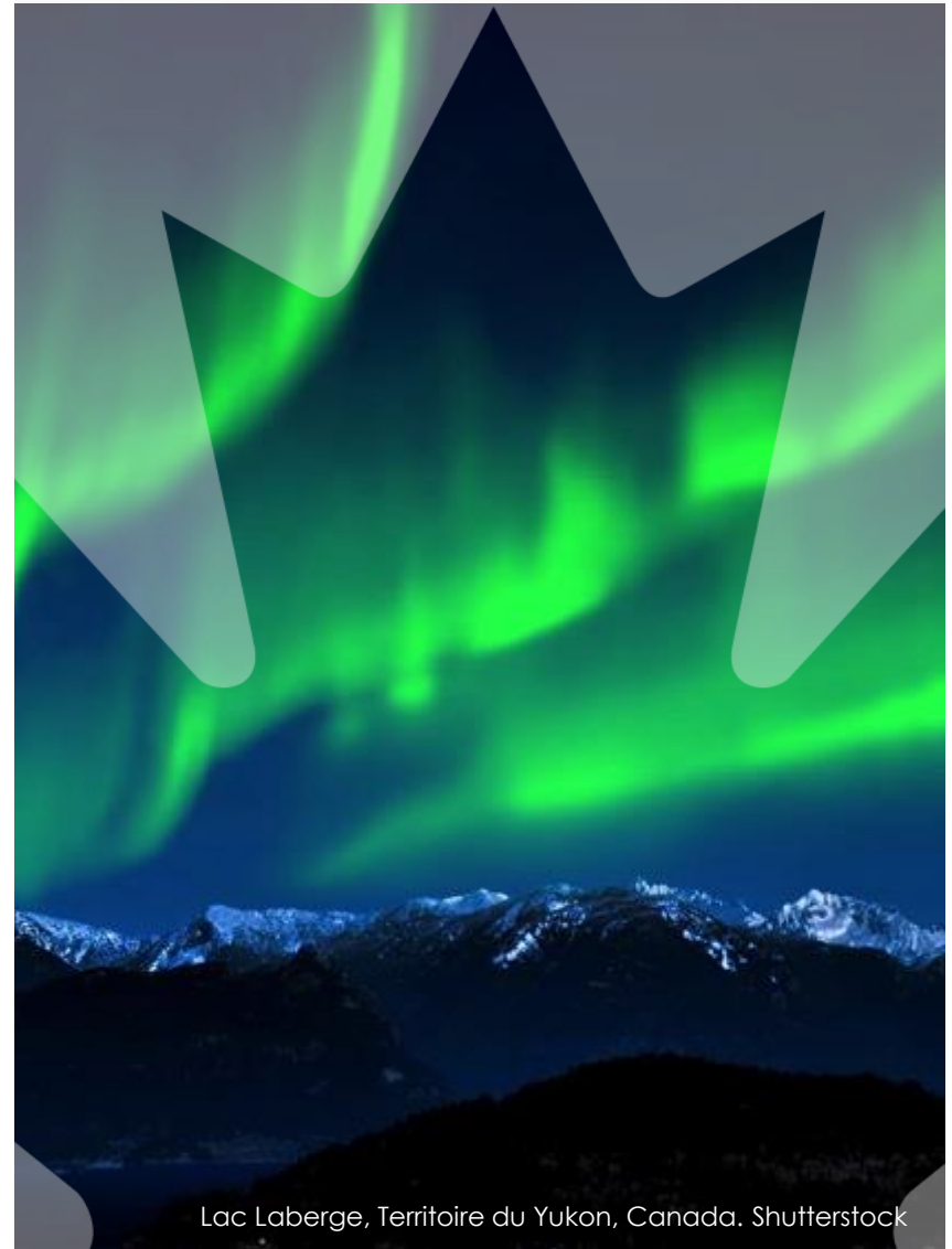
Lac Laberge, Territoire du Yukon, Canada.