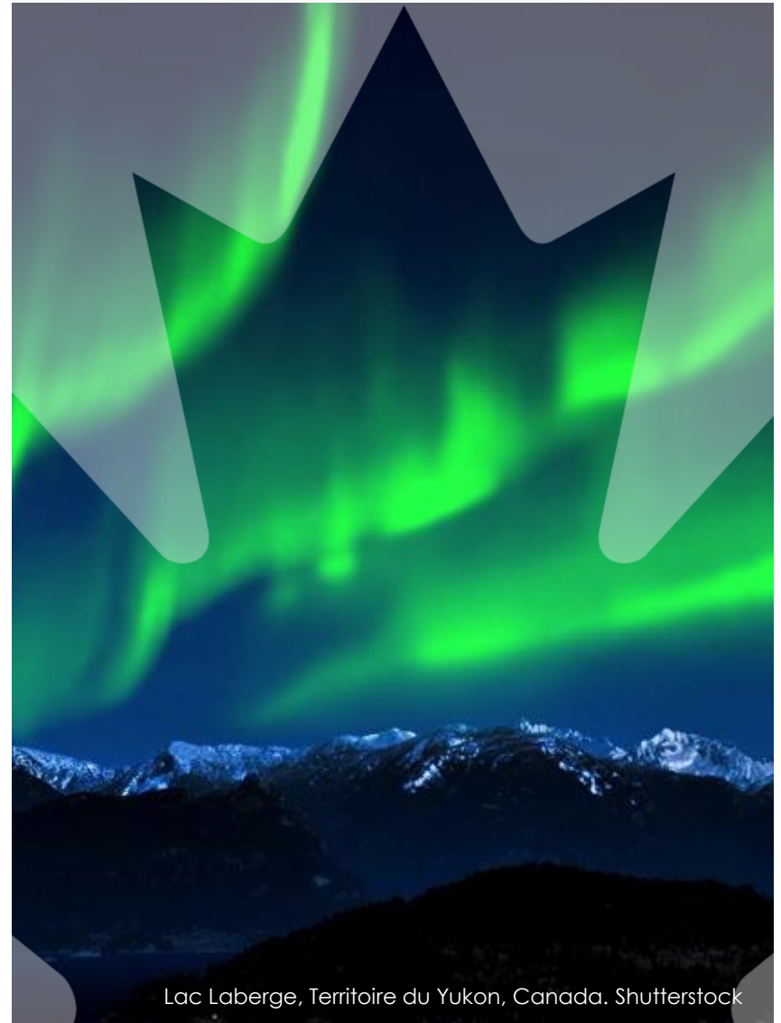
Lac Laberge, Territoire du Yukon, Canada.