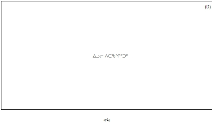
የፍትህ ማረጋገጫ ሰነድ 1. Pandalus borealis ለውጭ ግብርና ፍትህ ማረጋገጫ ሰነድ (A); የፍትህ ማረጋገጫ ሰነድ (ጠቅላይ ልማት 24, 2024) ለውጭ ግብርና ፍትህ ማረጋገጫ ሰነድ (TAC), (B); የፍትህ ማረጋገጫ ሰነድ የፍትህ ማረጋገጫ ፍትህ ማረጋገጫ ሰነድ (SSB) ለውጭ ግብርና ፍትህ ማረጋገጫ ሰነድ (LRP; 4,100 ለውጭ ግብርና ፍትህ ማረጋገጫ ሰነድ) ለውጭ ግብርና ፍትህ ማረጋገጫ ሰነድ (USR; 8,200 ለውጭ ግብርና ፍትህ ማረጋገጫ ሰነድ), (C); ለውጭ ግብርና ፍትህ ማረጋገጫ ሰነድ ለውጭ ግብርና ፍትህ ማረጋገጫ ሰነድ, (D); ለውጭ ግብርና ፍትህ ማረጋገጫ ሰነድ ለውጭ ግብርና ፍትህ ማረጋገጫ ሰነድ.