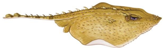
Figure 1. Thorny Skate.

Thorny Skate is distinguished from other skates in Canadian waters primarily by a row of 11–19 large thorns on the midline of its back and tail. This skate grows slowly, matures late, and produces only a few surviving hard-shelled egg cases (Mermaid's purses) each year. Average age at maturity is 11 years, and it lives at least 20–30 years.